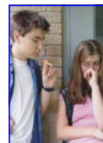
"Smoking in School is not permitted"