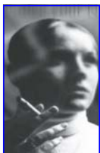
"Please do not smoke In this area"

See how Cig-Arrête® Tobacco Detection Systems can work for you by viewing our demo videos at: